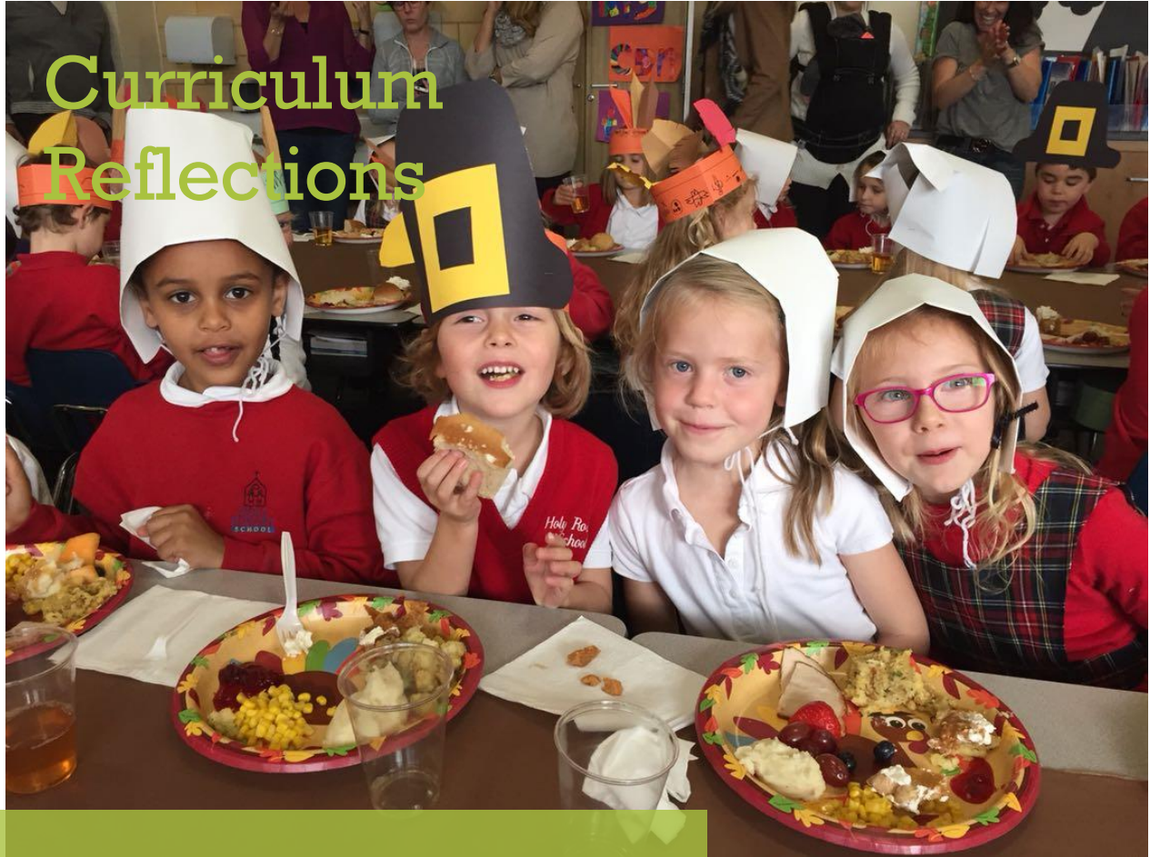
Thanksgiving Celebration – Kindergarten