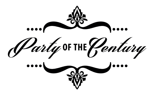
2014 HOLY ROSARY HEART AUCTION

Registration is in "full swing". It appears to be going well. All of our financial aid has been decided upon and distributed. Please get your forms in A.S.A.P.